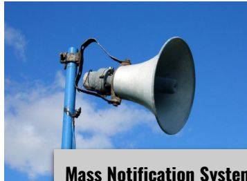
Mass Notification System

TAMIU may use one or more of the following methods to deliver emergency notifications: