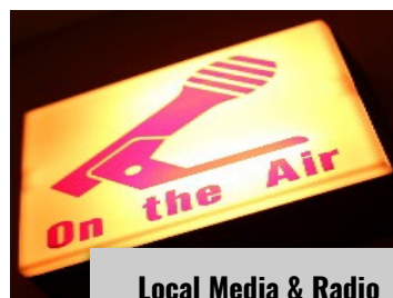
Local Media & Radio