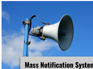
Mass Notification System

TAMIU may use one or more of the following methods to deliver emergency notifications: