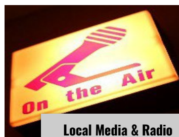
Local Media & Radio