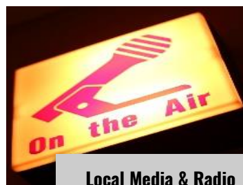
Local Media & Radio