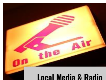
Local Media & Radio