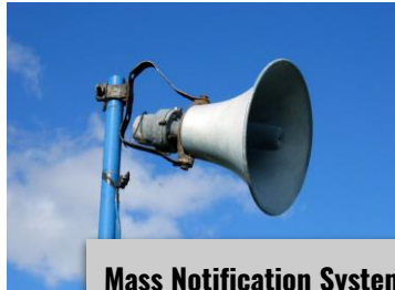
Mass Notification System

TAMIU may use one or more of the following methods to deliver emergency notifications: