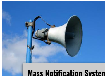
Mass Notification System

TAMIU may use one or more of the following methods to deliver emergency notifications: