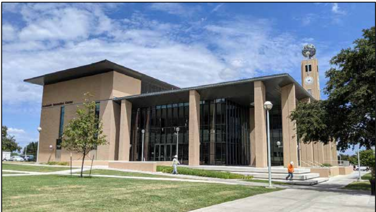
KCB North Lawn

5201 University Boulevard, Laredo, TX 78041