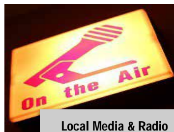
Local Media & Radio