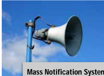
Mass Notification System

TAMIU may use one or more of the following methods to deliver emergency notifications: